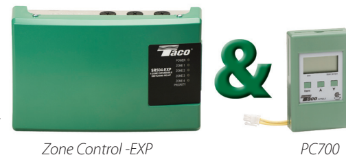
Zone Control -EXP

You can combine a Zone Control -EXP with a PC700 or you can use the new FuelMizer™ (SR501-OR) which has all the features needed for a cost effective package intended for the retrofit market. Both options feature Taco quality and reliability throughout.